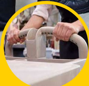
Ergonomic handle improves control and worker safety