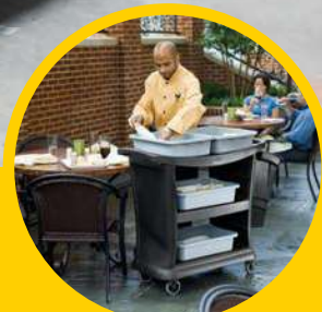
Versatile solutions for back- and front-of-house tasks