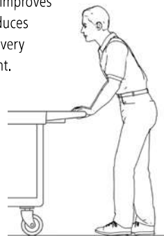
TRADITIONAL CART HANDLE DESIGN

The variable grip-height handle on our carts and trucks improves maneuverability and reduces muscle strain for most every user, regardless of height.