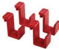
PACK OF 4 ACCESSORY HOOKS