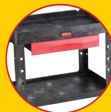
FG459300 SINGLE FULL EXTENSION DRAWER (see Cart Accessories)