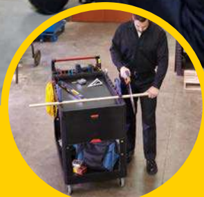
Integrated slotted v-notches for safe cutting