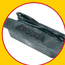
FG459000 3-OUTLET POWER STRIP