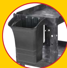
FG335388 8-GALLON REFUSE BIN