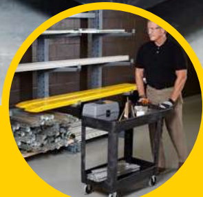
Durable construction and large capacities to handle big loads