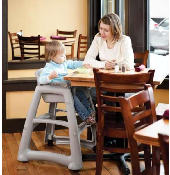
*2006 Rubbermaid Study