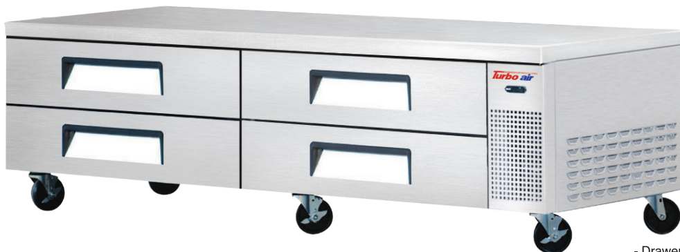
- Drawer Pans Not Included