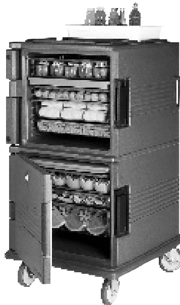
UPC1600 (Shown with 1600DIV ThermoBarrier® in top compartment and CP1220 Camchiller® in bottom compartment)