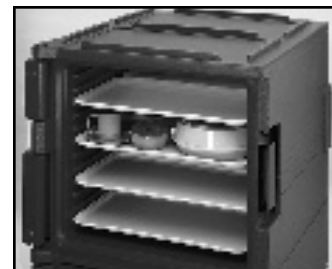
Gastronorm sizing accommodates 4 each GN 1/1 (Product #3253) fully loaded Metric Camtrays in each compartment.