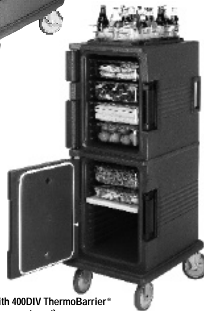
UPC800 (Shown with 400DIV ThermoBarrier® in bottom compartment)