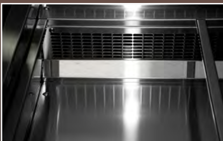
Cold air is blown under the produce