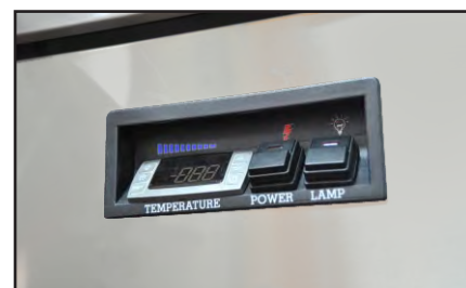
Micro-processor control with digital display

For details of your local dealer contact: