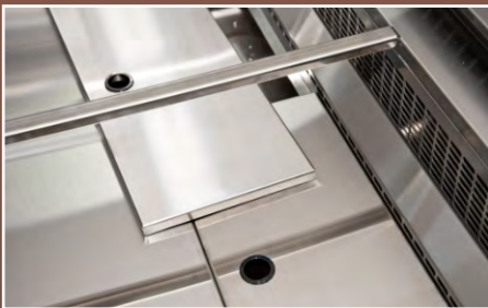
Removable floor panels for easy cleaning