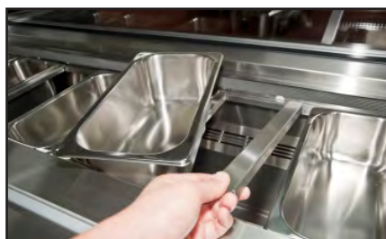
Interchangeable runners and gastronorm pans