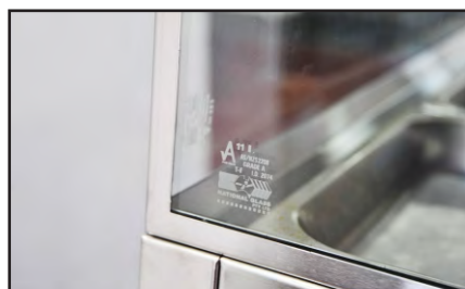
Toughened glass display case