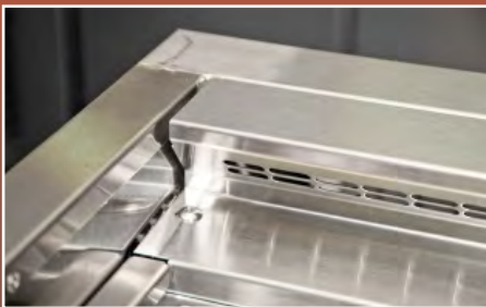
Cold air is blown above the produce