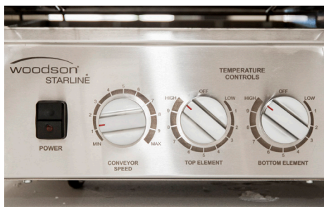
Individual temperature and speed controls

The Snack Master Small is sized to fit on any benchtop, allowing for perfect toasting.