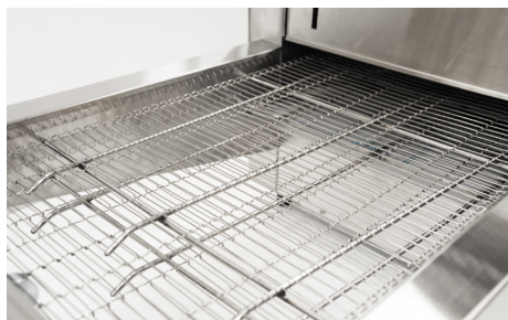
Belt extension for easy loading