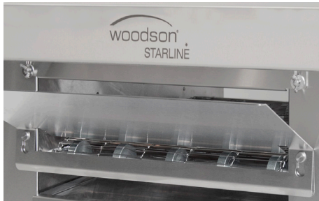
Front loading / exiting