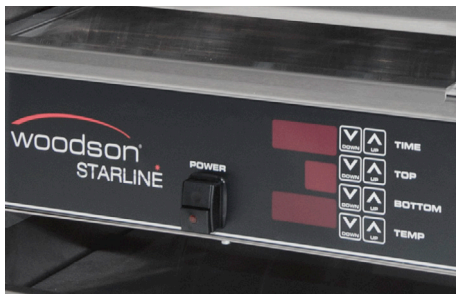
Belt and temperature control

The Bun 25 is Star line's reliable countertop unit, designed especially for toasting hamburger buns. It creates a more accessible and functional workspace for your kitchen.