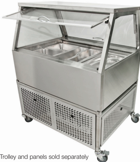
*Trolley and panels sold separately