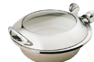
HA6-507 Round Chafer