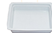
HA5-209 Square Porcelain insert