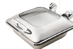
HA5-601 Square Chafer

Elegant and classy chafer units are available in two sizes and styles to suit any situation. These chafers offer 'controlled action' hinges and generous handles for optimum ease of use, with a clear window on the top giving easy viewing of the contents. Highest quality polished stainless steel finish combined with the 'stay open' feature will impress your customers. A full range of inserts, both stainless and porcelain, with or without dividers, and spoon holders completes this impressive range to make your buffet a success.