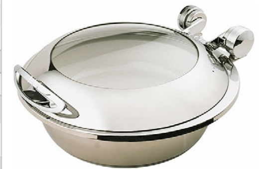
HA6-507 Stainless steel glass top 6.5 L Chafer

*Note: Multi zone units require separate power supply for each generator