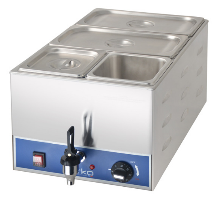
Note: pans & lids are not included